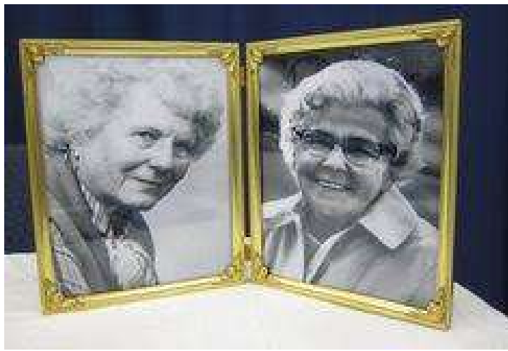
Anne B. and Lois W. – Co-Founders of Al-Anon